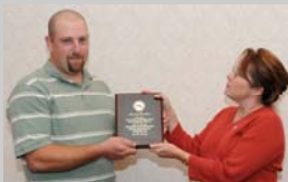
Town of West Stockbridge received the Best Small Plant Award.