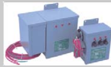
KVAR energy converters

The discussion will focus on the challenges concerning permitting, acquisition and installation? How does net metering affect you and your facility