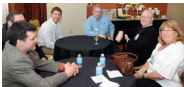
Operator's Luncheon 2009

Operators also took advantage of many technical sessions and visited over 175 vendor equipment displays.