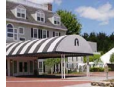
Westford Regency, Westford, MA. Location for Quarterly Meeting on March 18th

To register, please use the enclosed registration form. Registration deadline is March 13th. 2.5 TCHs will be awarded for operator recertification.