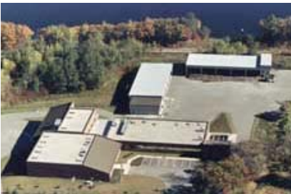
Gardiner Sanitary District Treatment Plant, Gardiner, ME