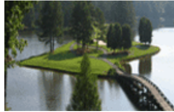
Wyckoff Country Club, Holyoke, MA

Golf sponsorships are also available. Have your company sponsor a golf hole or sand trap and help support MWPCA. Sponsoring companies will have their name displayed.