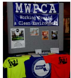
New MWPCA booth as displayed in January 2009.

The new booth was graciously donated by Environmental Operating Solutions.