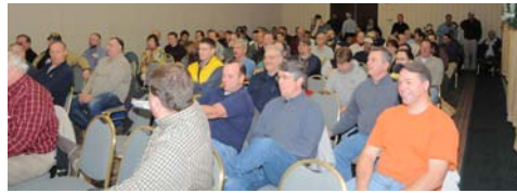
Only standing room was available at the quarterly meeting in December.

As discussed during the presentation, MA WARN is a community to community mutual aid system that provides services and/or equipment to repair/restore damaged infrastructure, whether water or wastewater related, caused by either natural or man made disasters. Under MA WARN, any public utility is allowed to voluntarily participate in the program. To participate in the program, a community would enter into a